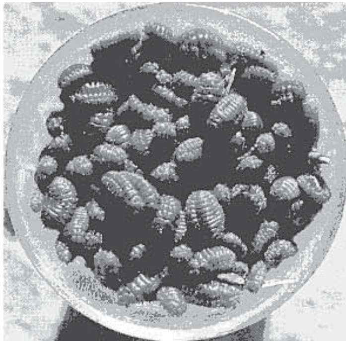
Ararat Kermes in a tea glass. (207)