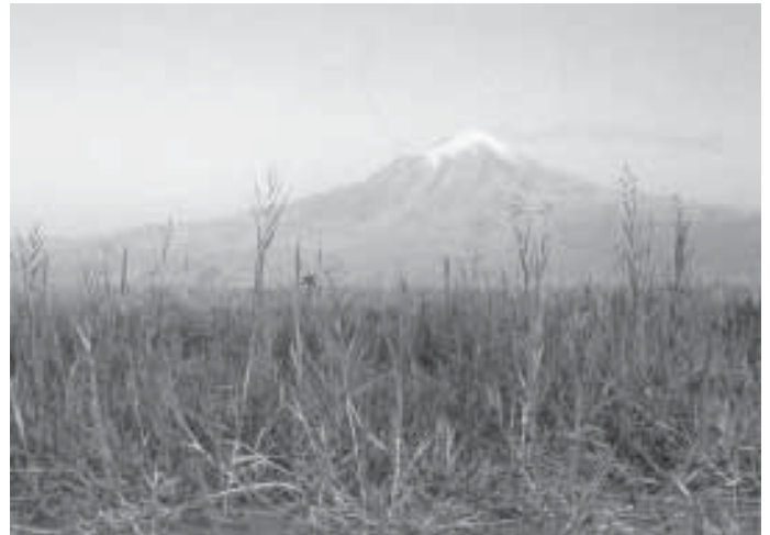
A host plant of the Ararat kermes with Mount Ararat in the background. (Bohmer, page 207)

This story about the sheep with red feet fascinated us 20 years ago.... [Our] trip in 1990 was successful: ...we found the right bugs. Before sunrise, they were crawling around on the surface of the ground and let themselves be easily